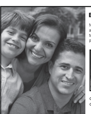
Balance Today with Retiring Tomorrow

Authors' names, taped to the floor, are the landing spots for the cakewalk among the stacks at the library. A separate children's cupcake walk featured children's book author names.