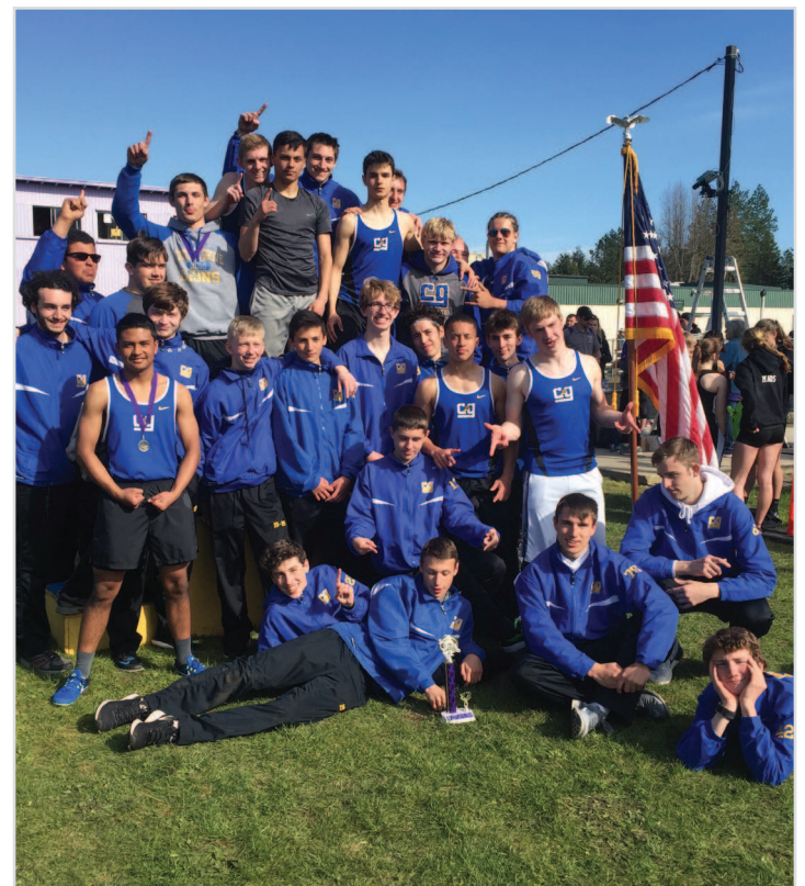
The Cottage Grove Boys Track Team won the 7 team Elmira Relays on Saturday and the girls team took 2nd place.