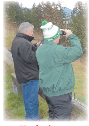
Eagle Count Local sightings of the national bird, page 8A