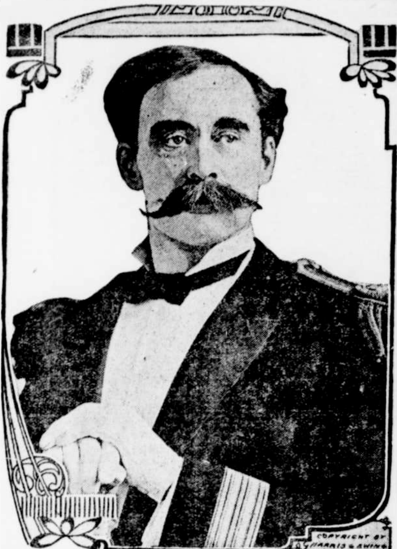
COMMANDER ROBERT E. PEARY.

Now let us urge upon the citizens of this community to patronize the home merchant; the man who spends his money in an endeavor to get your patronage is the man who will treat you right in an effort to keep it. Any community is better off for having a good newspaper, but without the support of the business people a newspaper could not exist, and un-