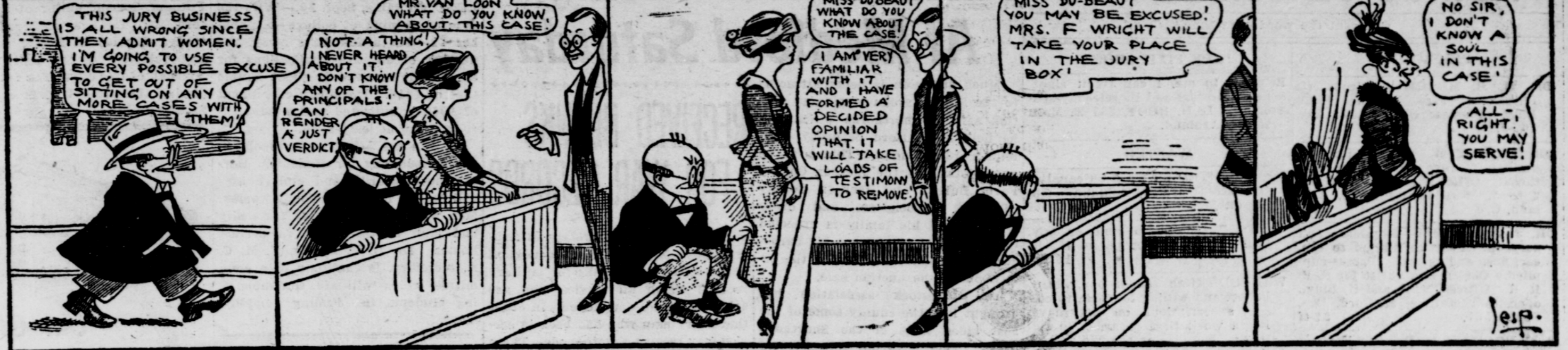
Yes, Father should have stuck to his first idea

Dance at Talent Friday, Sept. 12 Good time and good floor. 10-21