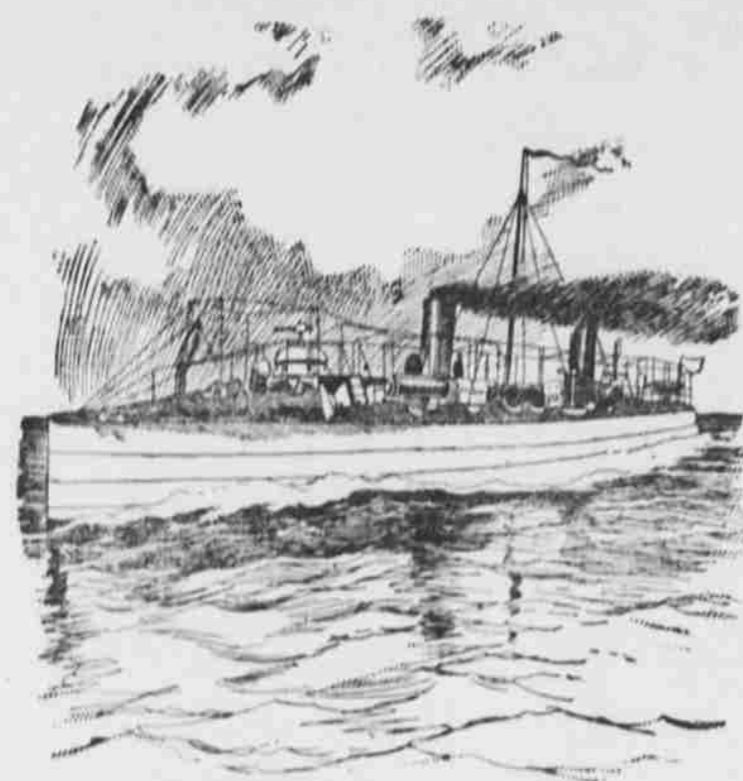
TORPEDO BOAT FOOTE.

The Foote is swift as the wind. She can do 24.5 knots an hour and has 2,000 horsepower. Her displacement is only 143 tons, and she cost $97,500. Numerous torpedoes and six small guns are her weapons of offense and defense.