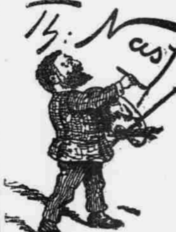
THOS. NAST, In his Artistic Entertainment, Drawing in Black and White and Painting, in Oil Colors, in the presence of the audience.