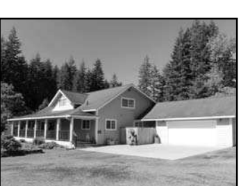
FEATURED LISTING Country Beautiful 5.48 ac fenced, 8+ horse stalls, arenas, 40 x 40 shop plus garage/shop. Remodeled home w/hickory cabinets, wood floors. Hot tub overlooks pond 3-4 Bdrms, 2 Ba 2404 sq ft $499,900 BH7086 ML#15676288