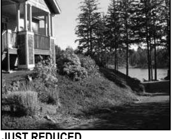
Spectacular home with amazing Siltcoos Lake views. Rows of windows to enjoy the views! 3 Bdrm, 2 Ba 1751 sq ft $349,900 BH6758 ML#14075289