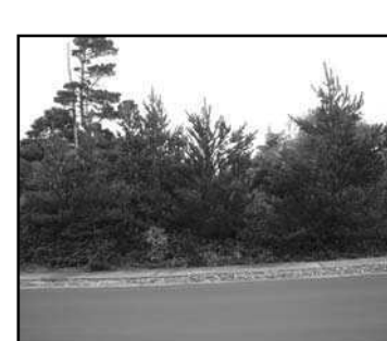
PRICE REDUCTION Interior Shelter Cove gated community lot. Stick built homes.34 acre, city services available. Priced to sell!