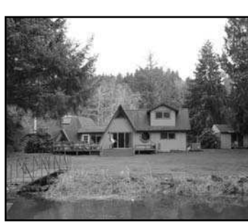
PRICE REDUCTION Siuslaw riverfront retreat. Plenty of room for RV's, boats & parking 2 Bdrm, 2 Ba 2137 sq ft $180,000 BH6705 ML#14119616