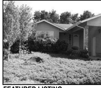
FEATURED LISTING Private community fishing & crabbing pier on the Siuslaw River! A gated place for your RV. Home is clean, neat & squared away. 2 car garage. $223,000 BH7093 ML#15464027

View active listings with our exclusive Market Watch based on what is important to you.