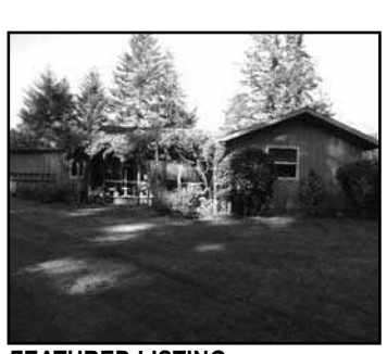
FEATURED LISTING Love a country setting? This home is for you. Beautiful country setting just minutes to town. Home has spacious living room & country kitchen 3 Bdrm, 2 Ba 1563 sq ft $280,000 BH7114 ML15380264