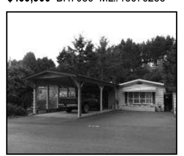
FEATURED LISTING Enjoy gated community living... delightful & fun singlewide with addition. Front kitchen, party/family room. RV/parking 3 Bdrm, 2 Ba 1675 sq ft $78,000 BH7149 ML#15170659