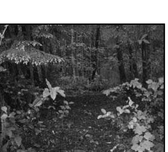
PRICE REDUCTION Native country lot close to town $27,995 BH6501 ML#13597998

...or give us a call at 541-997-6000 and we'll do the searching for you!