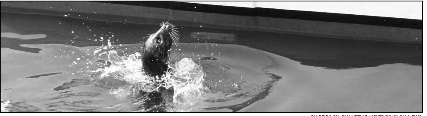
Three harbor seals followed fishing boats into the Port of Siuslaw docking area during Florence's annual Rods 'n' Rhodies on Saturday, Sept. 12. People visiting the car show or walking through the Boardwalk Market watched the seals play, splash, tease seagulls and swim past the boats.