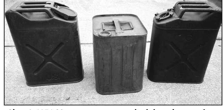
Above) 1951 Nesco water can on the left; unknown vintage Navy tin in the middle; 1951 Radiosteel fuel can on the right; (far right) USN "Rum" container