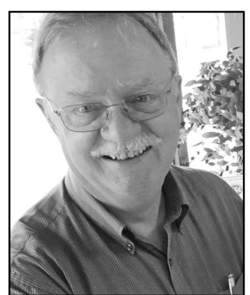
Special to the Siuslaw News