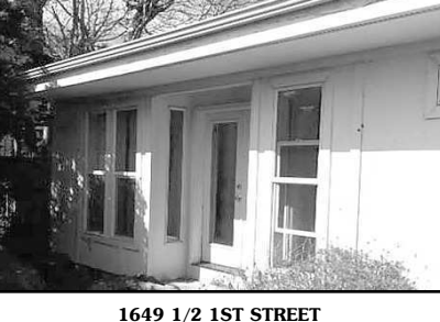
1649 1/2 1ST STREET OLD TOWN FLORENCE HOME. Short walk to water front and Old Town shops. Private fenced courtyard with southern exposure. $165,300 #10999 MLS#15653325