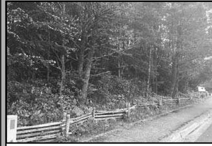
MUNSEL CREEK DRIVE Great wooded lot in town among neighborhood of fine nomes. City services available. Backs to Munsel Creek greenbelt. $55,000 #11038 MLS#15086517