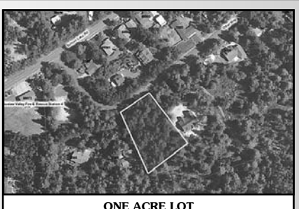
ONE ACRE LOT In area of quality homes. Level site. Septic approval, Heceta water available. Nice trees and privacy. Easy to develop. Close to town. Sunny, wind sheltered area. $85,000 #10982 MLS#15486157