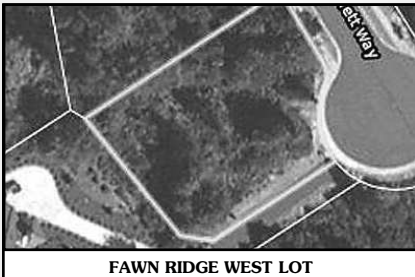
FAWN RIDGE WEST LOT Ocean view lot in area of fine custom homes in gated Fawn Ridge subdivision. All underground utilities, protective CC&Rs. Cul-de-sac location, heavily treed and filled with native vegetation. 2nd story home would enhance the excellent views $85,000 #10975 MLS#15190841