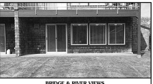
BRIDGE & RIVER VIEWS from this downstairs, one level condo at the west end of Bay Street. 1048 sq. ft. with 2 bedrooms, 2 baths, woodstove, slider to outside with nice grassy area off patio makes this Bay Bridge Condo a fabulous buy. $233,000 #10981 MLS#15119363