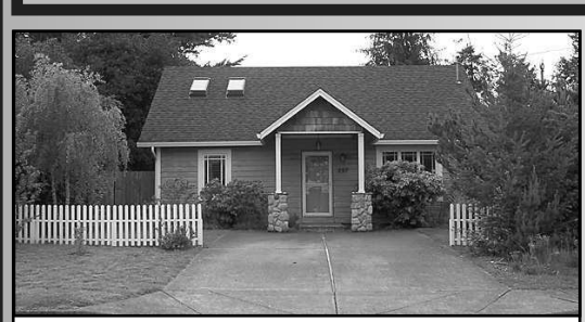
1936 CHARMER 2 bedroom, 2 bath, office, 1372 sq. ft. home just minutes to walk to Old Town. Upgrades that feature bamboo floors, French doors, crown molding, clawfoot tub, Trex deck. Must see! $185,000 #11029 MLS#15221988