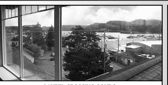
LAUREL CROSSING CONDO Sold fully furnished as an ongoing vacation rental. Perfect Old Town getaway for an occasional visit, plus income from nightly rentals. Quaint 2 bedroom condo, tastefully decorated with private balcony & storage. Distinctive NW design in the heart of Old Town. New laminate floors & walk-in shower in March 2015. $215,000 #11016 MLS#15688971