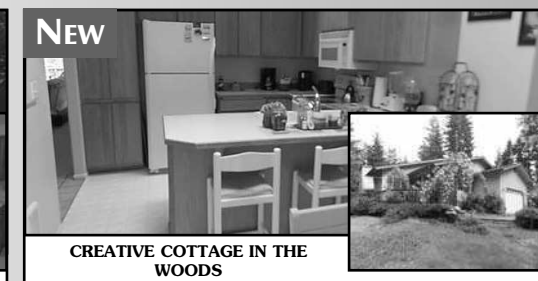
Be inspired by the storybook setting and so close to everything! A hop, skip & a jump to Woahink Lake & the dunes, just minutes to town. Terrific 3 bedroom, 2 bath layout opens to a backyard deck, fenced yard & charming studio/guest quarters (wired & plumbed). All surrounded by lush greenery. $227,500 #11037 MLS#15577322