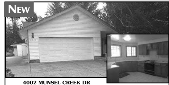
4002 MUNSEL CHER DR LOVELY HOME in nice area of fine homes that backs up to Munsel Creek green belt. The kitchen has oak cabinets & corian counters. The living room has a wood burning stove & a slider that connects to an outdoor covered deck. There is RV parking & hook-ups on the side. Come see it! $236,500 #11042 MLS#15223330

2 bedroom, 1 bath custom riverfront home with cedar shingle siding & metal roof. 3 huge skylights add to the open floor plan with cathedral ceilings. Beautiful natural wood flooring & custom cabinetry in living & library/computer rooms. Large windows offer wonderful views of Siuslaw River & valley. Extra roomy finished 1029 SF double car garage is wired for 220. Registered deep water dock has Trex decking. $225,000 #11044 MLS#15285881