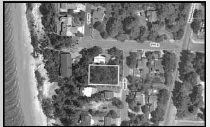
EXCELLENT NEIGHBORHOOD Close to Siuslaw River, hospital and town. Easy owner financing. 78' x 120' lot – wooded and private with nice homes all around. A great way to invest in a piece of Florence. No CC&R's: $50,000 #10518 MLS#12387105