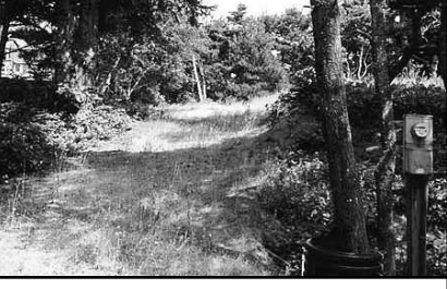
88219 1ST AVE. All squared away & ready to go. 0.14 acre lot one block from beach. all utilities are in, even comes with 2-story cabin plans so you can get that view of the ocean. $95,000 #10879 MLS#14673411