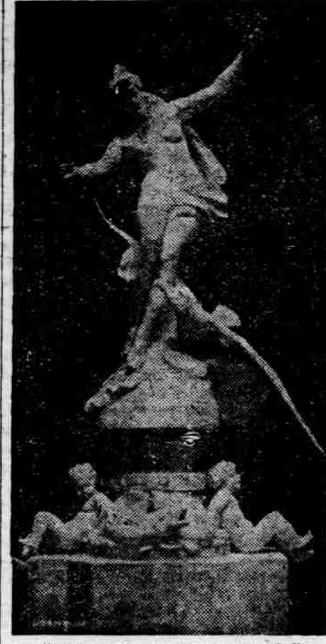
THE SPIRIT OF THE PACIFIC."