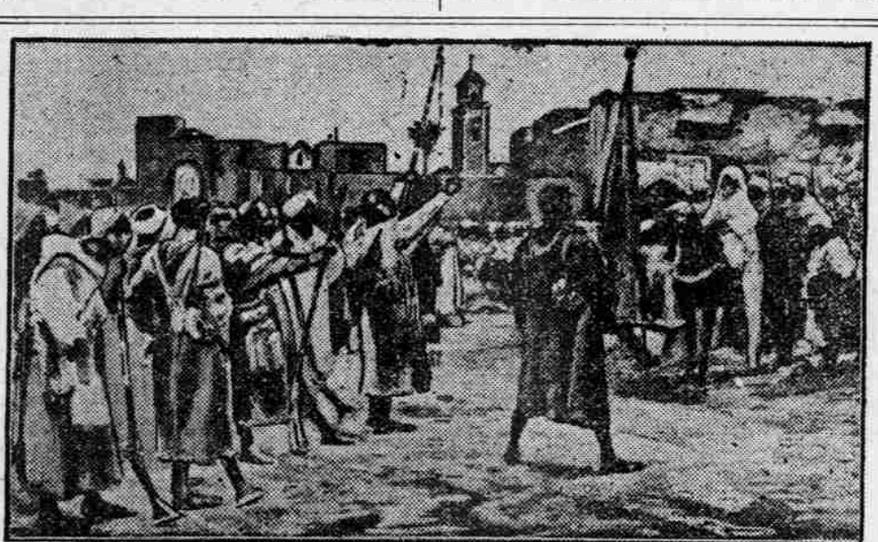
MOORS DEFY THE AUTHORITY OF THEIR SULTAN.

ing a barrier against the hot winds cowcatcher or possibly an ordinary tains, and the summits of these are when the cow slightly raises her hoof