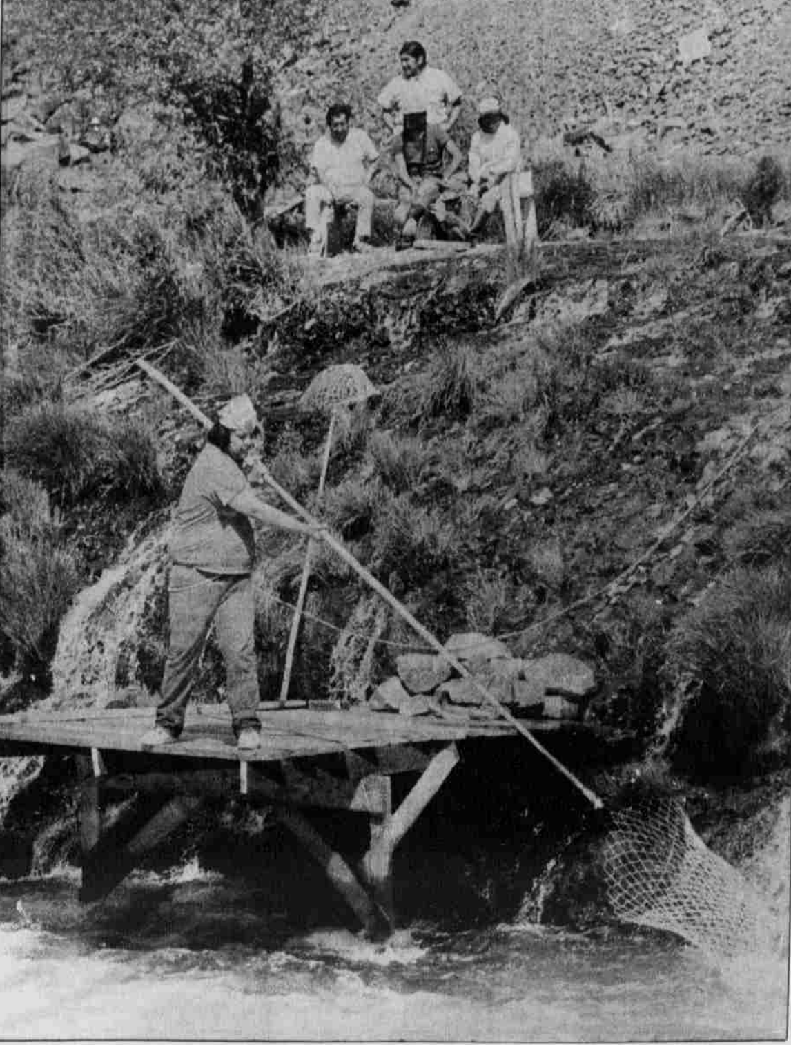
Dip-netter at Sherar's Falls takes advantage of the spring chinook run.