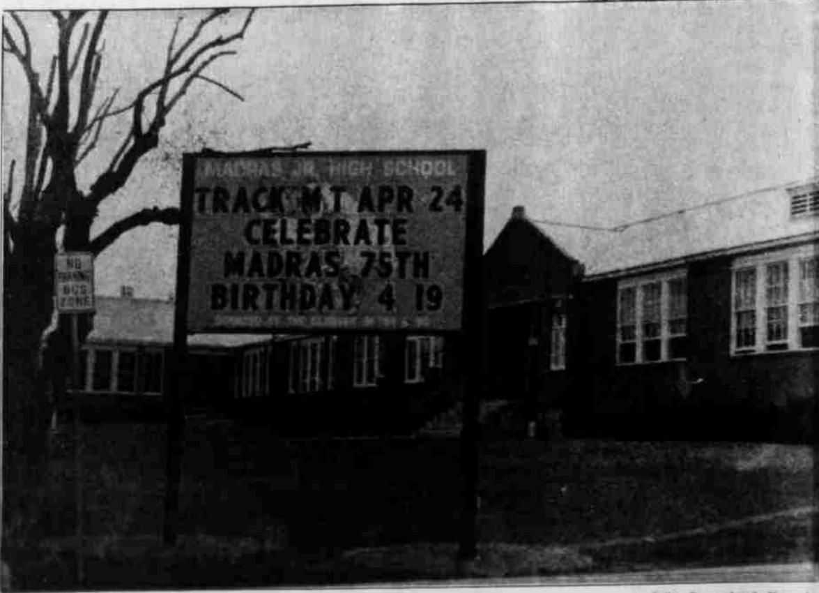
Spilyay Tymoo photo by Shewczyk

Week V—June 4, 1986 Introduction of Step 1 of A.A. and film—Urbana Manion Importance of Step 1 in Sobriety and Obstacles of Treatment "We admit we are powerless over alcohol and that our lives had become unmanageable."