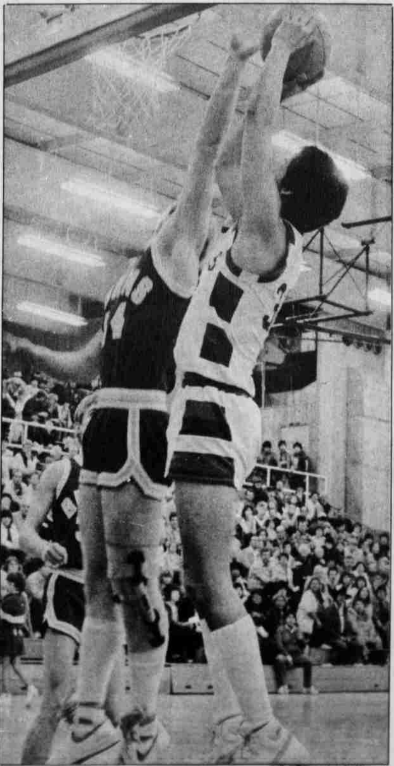
Good guarding by Hilanders didn't stop Buffaloes from taking the lead during final play-off game to determine first place at state tournament. Tournament is set for March 18-22 at University of Oregon's MacArthur Court.