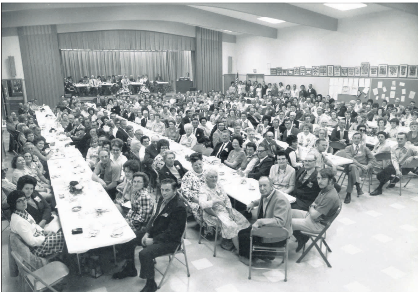
Joseph High School Alumni meeting

• Enterprise needs a good, stiff dog tax to eradicate the nuisance of numerous bands of worthless curs that roam the principal streets at all hours, to say nothing of the consequent danger from rabies.