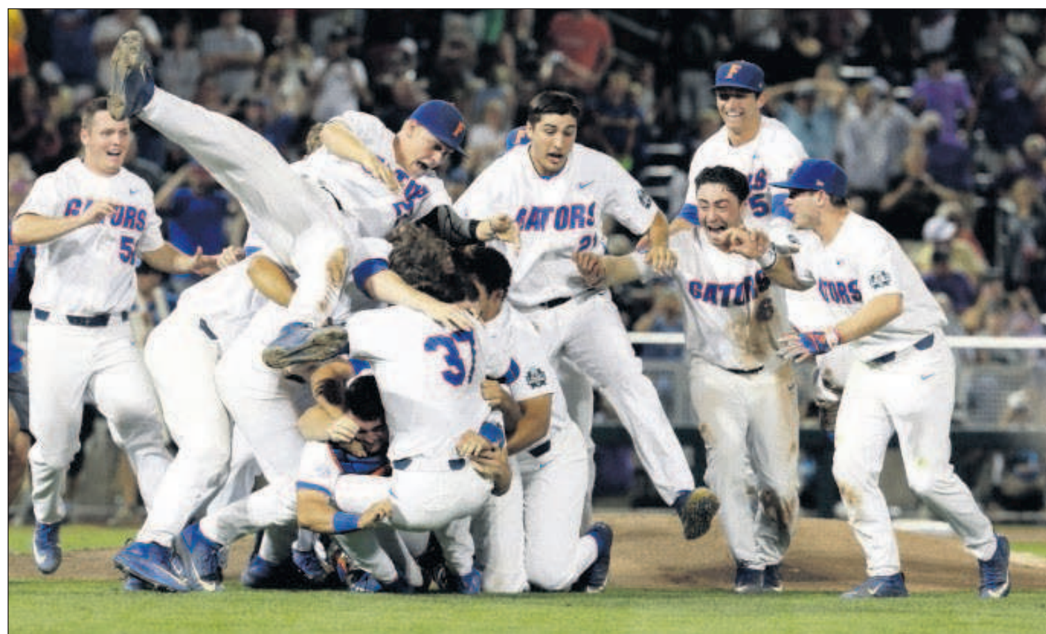
Florida players celebrate after defeating LSU in Game 2 to win the NCAA College World Series baseball finals in Omaha, Neb., Tuesday, June 27, 2017.