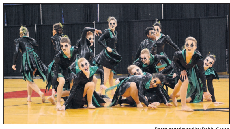
The Hermiston dance team Stardust performs at the state championships March 18. The team finished fifth.