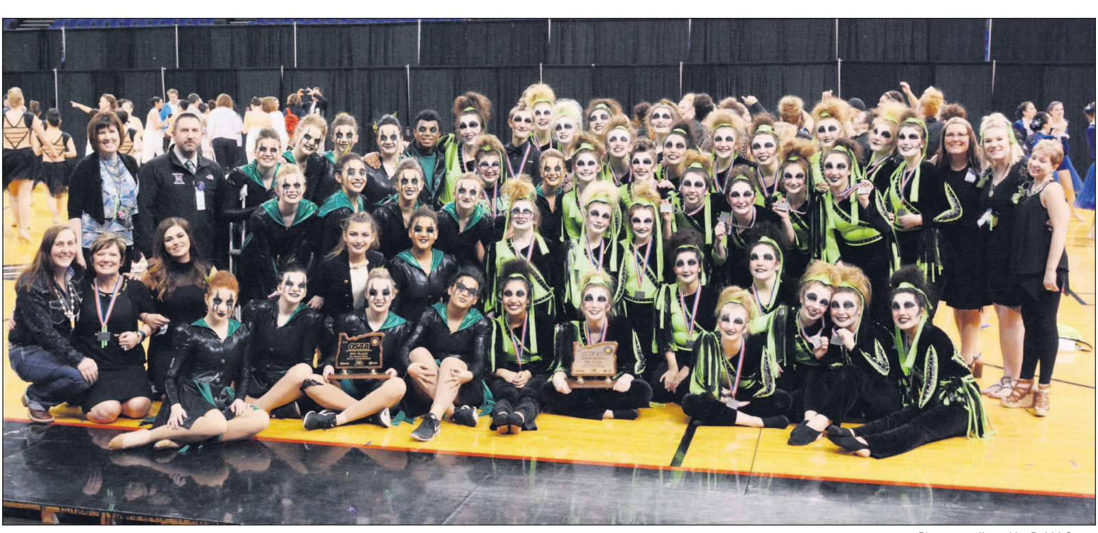
The Pendleton dance team Rhythmic Mode finished second at the state championships March 18 at the Moda Center in Portland.