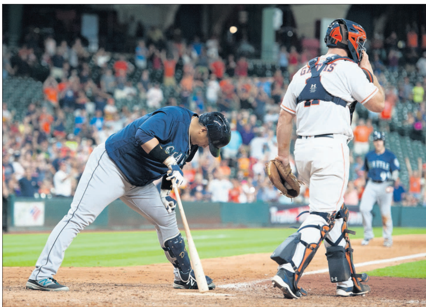
The Seattle Mariners Dae-Ho Lee (10) reacts after striking out to end the game as Houston Astros catcher Evan Gattis (11) walks away in the Astros 9-8 victory in a baseball game Wednesday, July 6, 2016, in Houston.