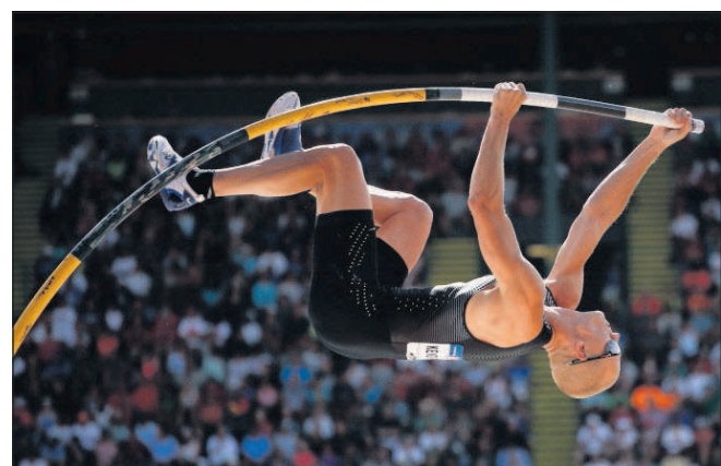
In this July 4, 2016, file photo, Sam Kendricks competes during the men's pole vault event at the U.S. Olympic Track and Field Trials in Eugene Ore.