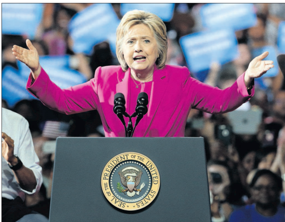
Democratic presidential candidate Hillary Clinton speaks at a campaign rally in Charlotte, N.C., Tuesday with President Barack Obama.