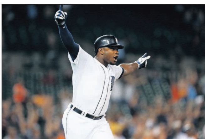
Detroit Tigers' Justin Upton celebrates his walk-off home run against Seattle during Monday's game.

DETROIT — Justin Upton hit a line drive over the left-field wall in the 12th inning for his second home run of the game, lifting the Detroit Tigers past the Seattle Mariners 8-7 on Monday night.