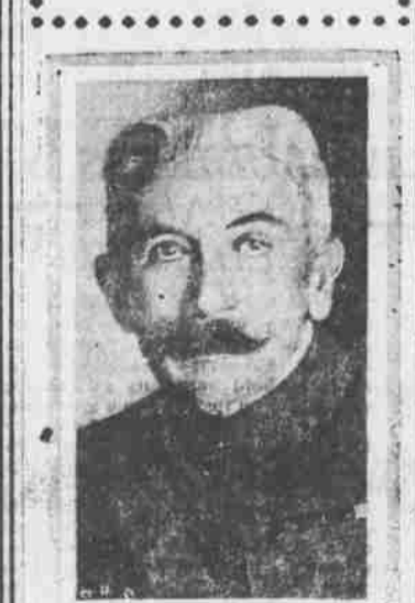
General Hubert Lyautey, the French war minister, at his desk in the office of the war department in Paris. This is a recent photograph which has just been received in this country.