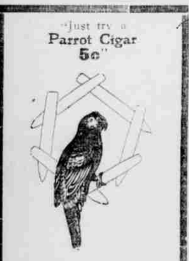
THE PARROT CIGAR IS A SUPERIOR 5-CENT CIGAR. THEY MIGHT HAVE MADE OTHER BRANDS AS GOOD, BUT THEY DIDN'T.