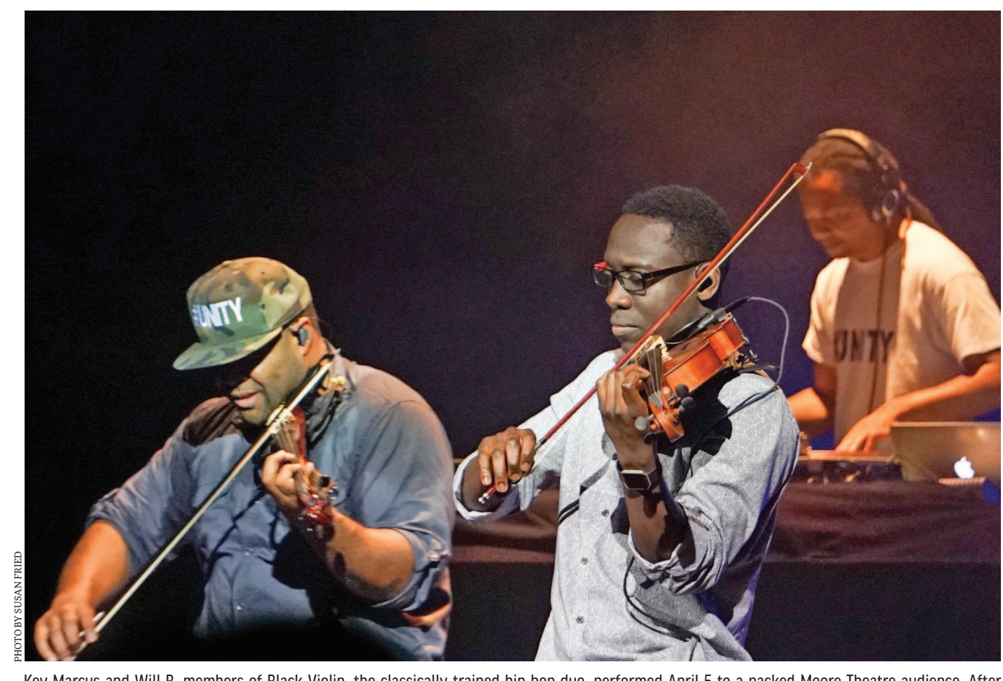
Kev Marcus and Will B, members of Black Violin, the classically trained hip hop duo, performed April 5 to a packed Moore Theatre audience. After starting their Unity Tour in Portland on April 3, the popular violinists stopped in Seattle before heading off to perform in 13 more cities before ending their tour on June 18 in Washington D.C.