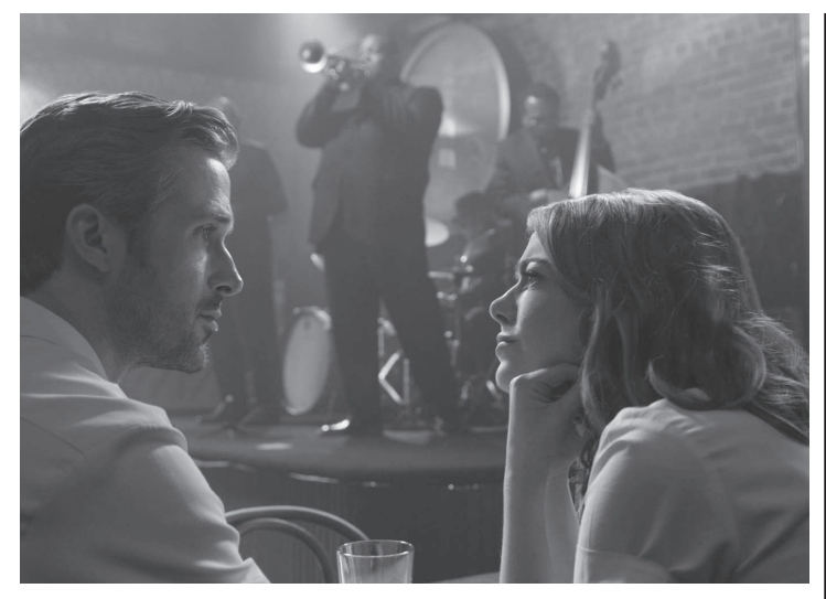
Kam predicts 'La La Land' to win Best Picture

Question: Why was "Moonlight" nominated for the Best Adapted Screenplay Oscar, but nominated in