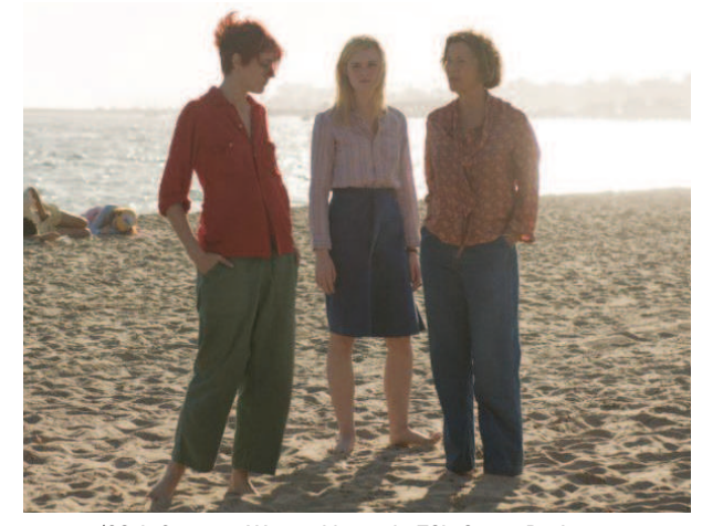
'20th Century Women' is set in 70's Santa Barbara.