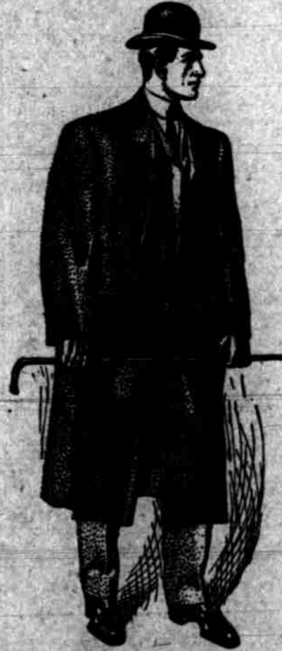
Copyright 1904 by Hart Schaffner & Marx

The "Multnomah" $3.00 Hats LEAD THEM ALL—NONE BETTER FOR THE PRICE