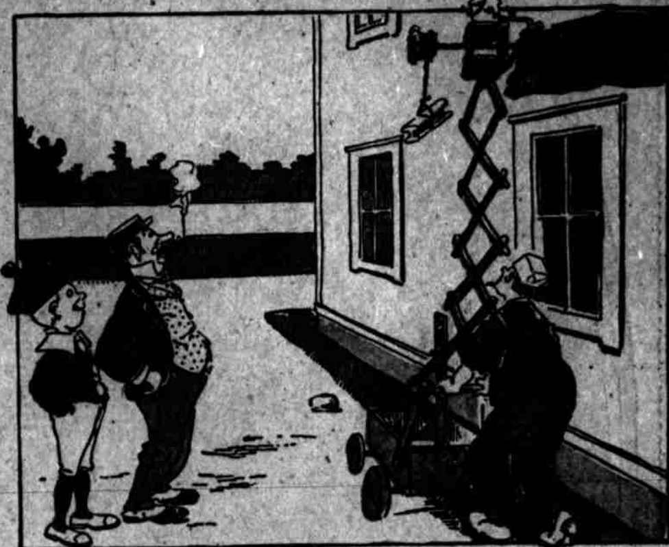
3. You could elevate it to any height and just push it along the side of the house.