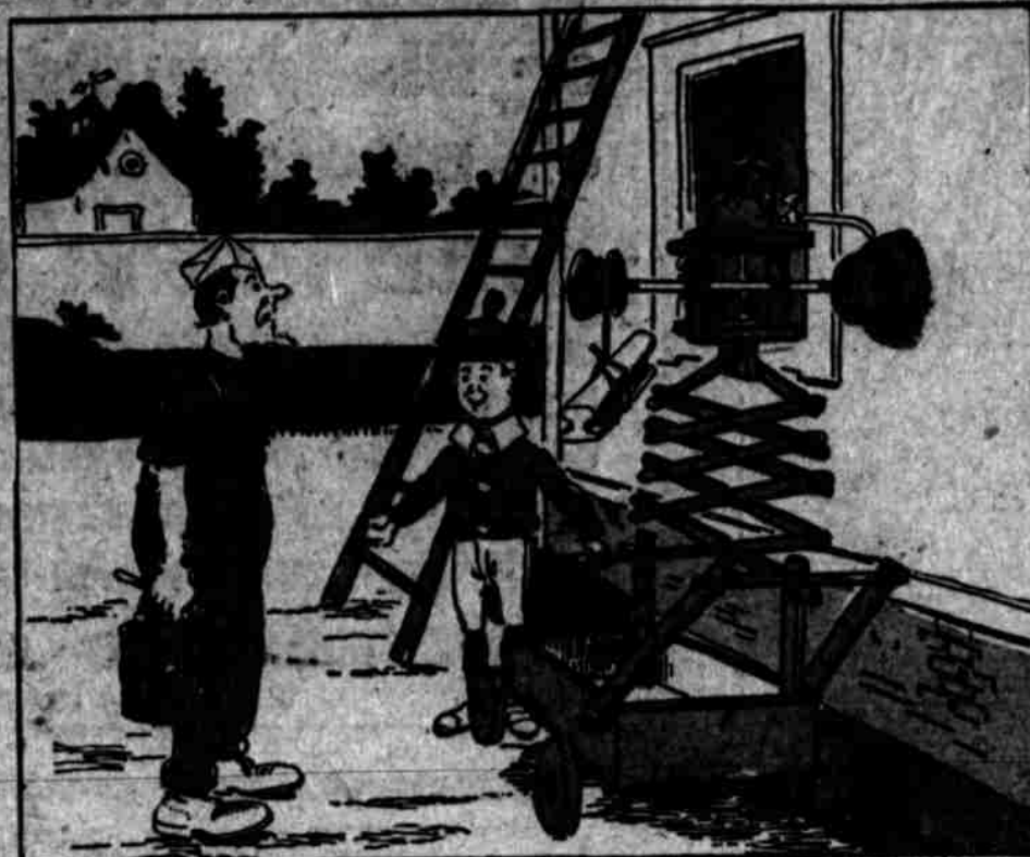
2. I built an automatic house-painter with an automatic revolving brush run by a weight.