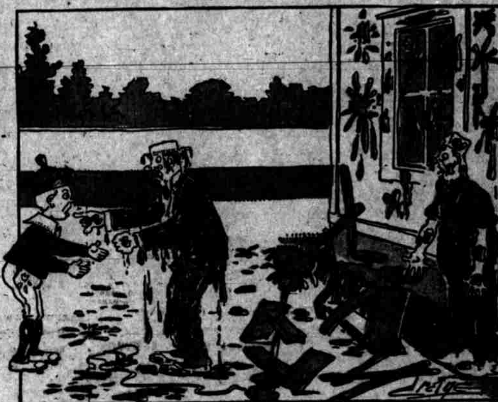
6. Papa, of course, blamed me because the painter ran the machine against the stone. Yours, Willie.