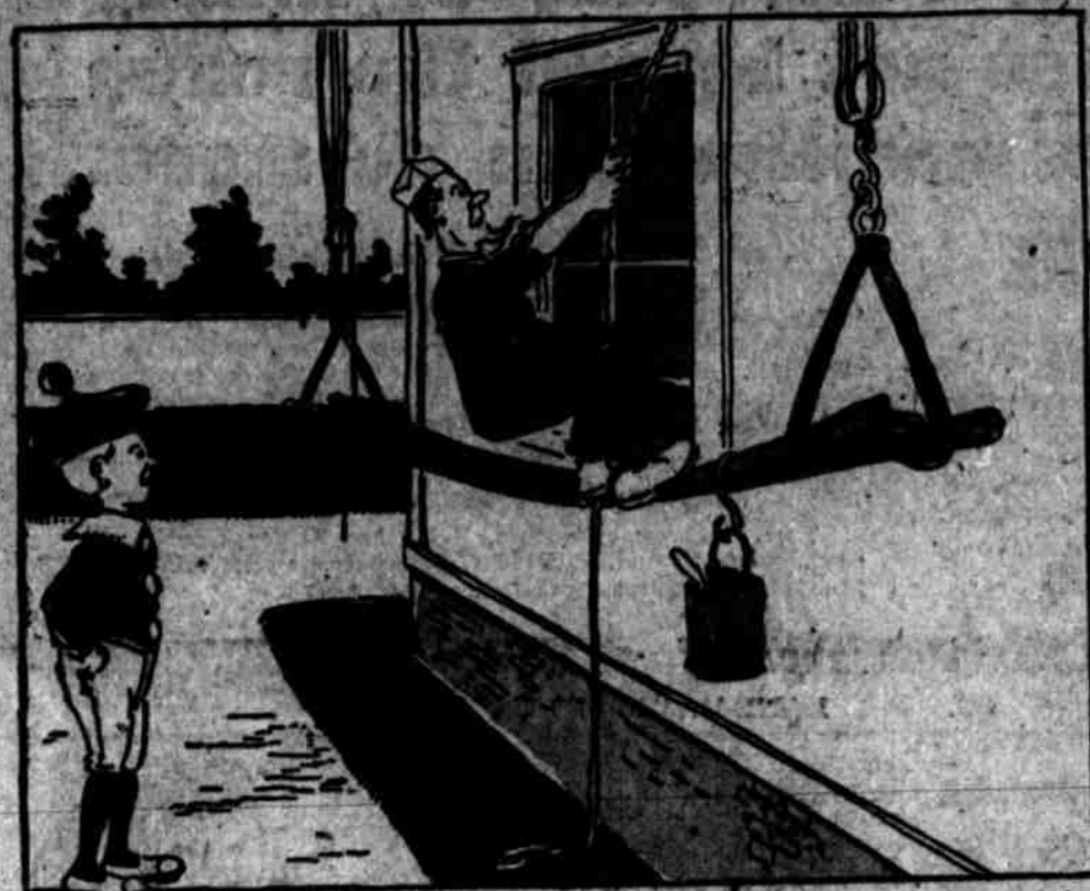
1. Dear Tommy:—The Painters are doing up our house. It's awful dangerous the way they work on those swinging scaffolds.