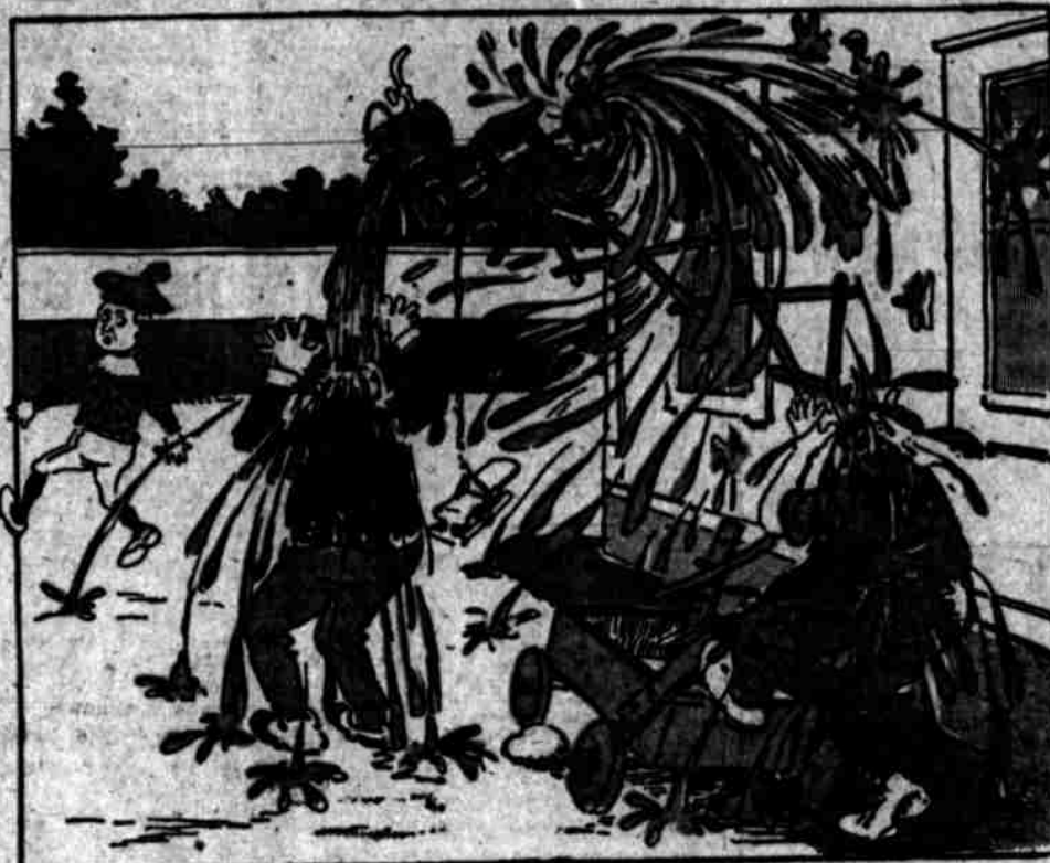
5. Then there was trouble. Say, Tommy, it was awful.