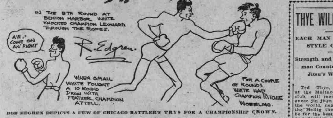
BOB EDGREN DEPICTS A FEW OF CHICAGO BATTLES' TRYS FOR A CHAMPIONSHIP CROWN.