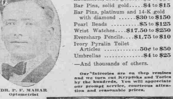
DR. P. F. MAHAR

Rings, all solid gold. $2.50 to $25 Brooches, solid gold.....$3 to $20 Lavallieres, solid gold . . . . $3 to $50 Bar Pins, solid gold .... $4 to $15 Bar Pins, platinum and 14-K gold with diamond ..... $30 to $150 Pearl Beads ...........$5 to $125 Wrist Watches .... $17.50 to $250 Eversharp Pencils....$1.75 to $10 Ivory Pyralin Toilet