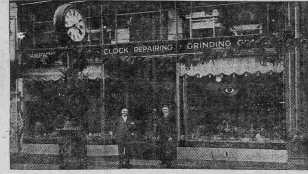
Front of Store-266 Morrison Street

at prices as low as five dollars for some pieces.