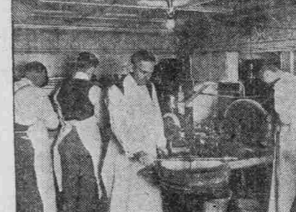
CORNER IN OPTICAL FACTORY.