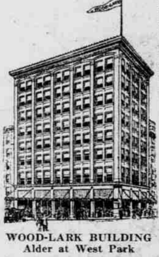
WOOD-LARK BUILDING Alder at West Park