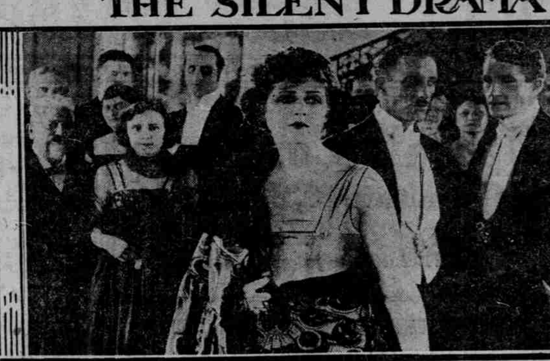
Moment From Katherine MacDonald's "Playthings of Passion" At The Liberty.