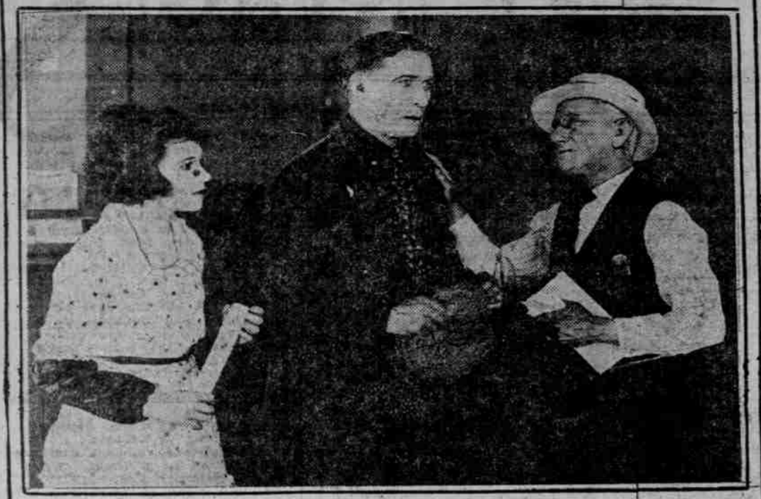
Scene From "Sand" Starring William S. Hart At The Columbia.