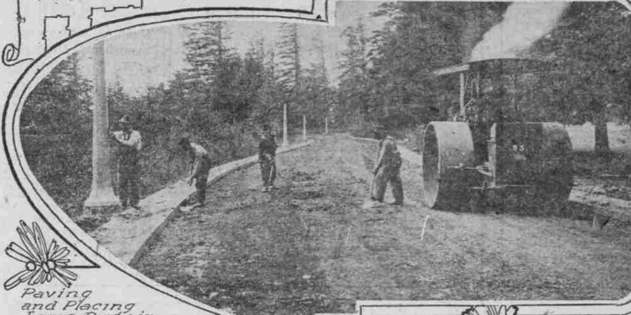
Paving and Placing Lamp Posts in Mt. Tabor Park.