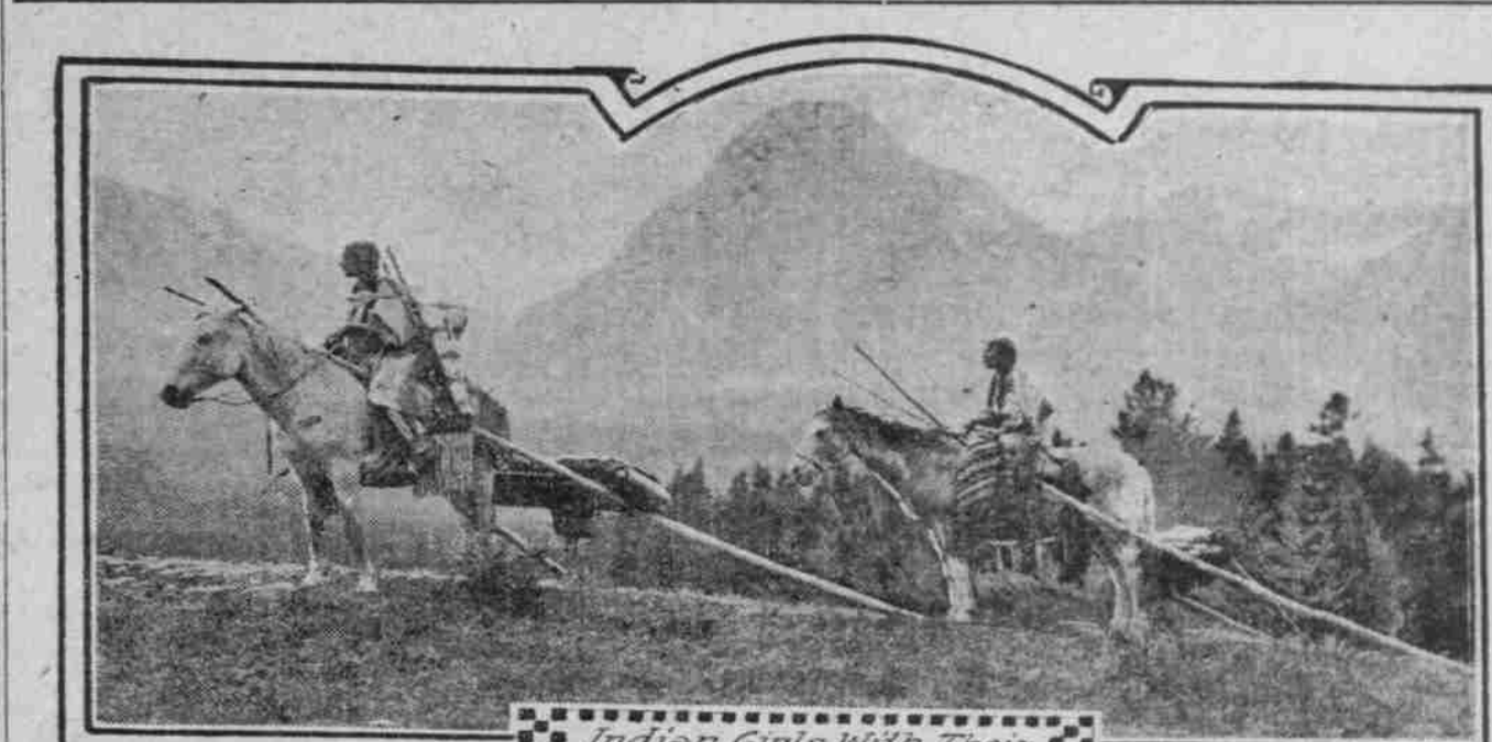
Indian Girls With Their Travois, to be Feature of Parades.