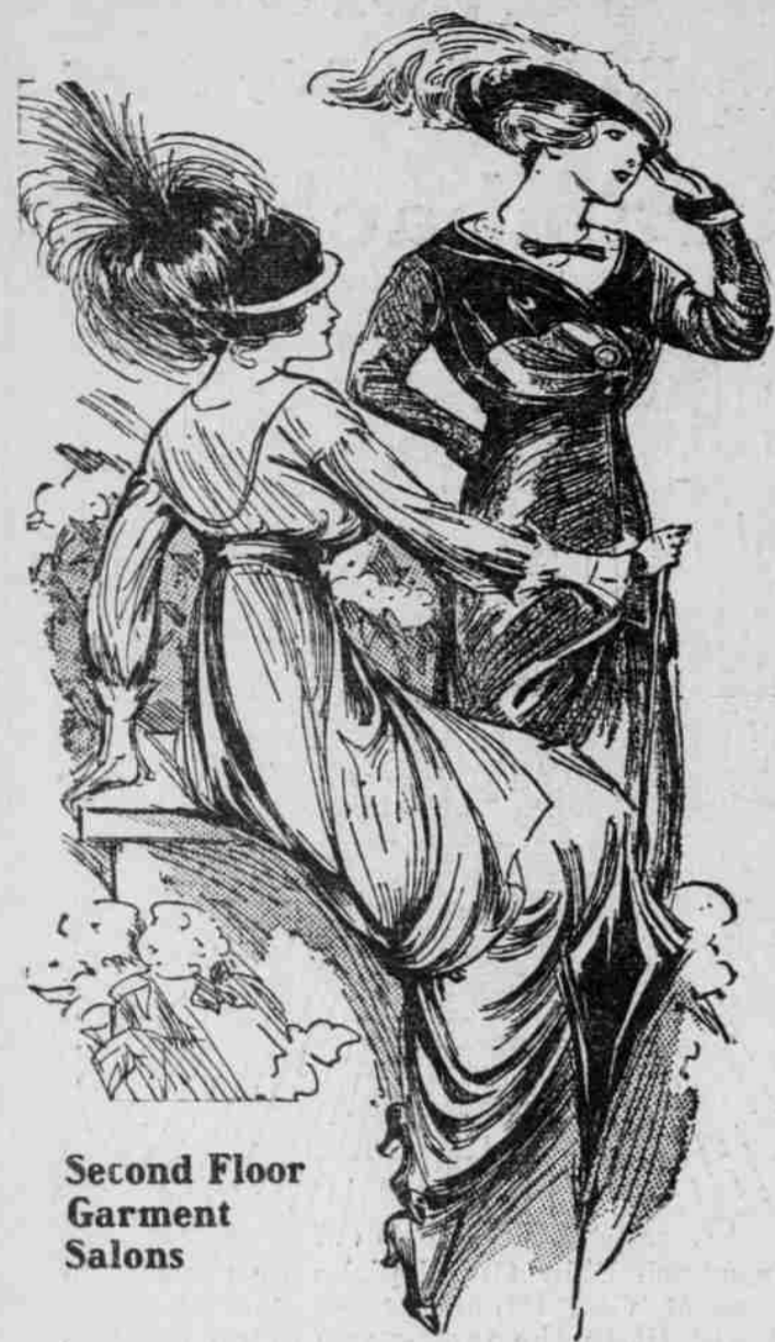
Second Floor Garment Salons

FREE!—PANAMA CANAL in Operation The talk of all Portland is the Free exhibit of the Panama Canal in operation on our Fifth Floor—it's a large working model. A topographical display, correct in every proportion and detail. Thousands are daily viewing this wonderful display. Come to our Fifth Floor and see it tomorrow.