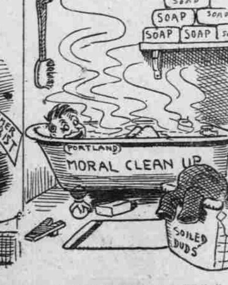
"I Need This Once in a While."