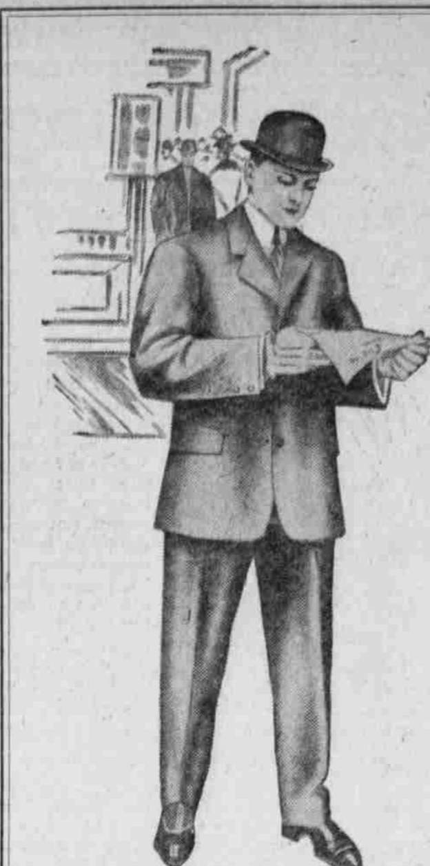
SEE OUR BIG WINDOW DISPLAY

so much for his wife that the thought of leaving her permanently overwhelmed him. Then he flashed it out that all his troubles were due to the fact that he had money and that his wife was rich.