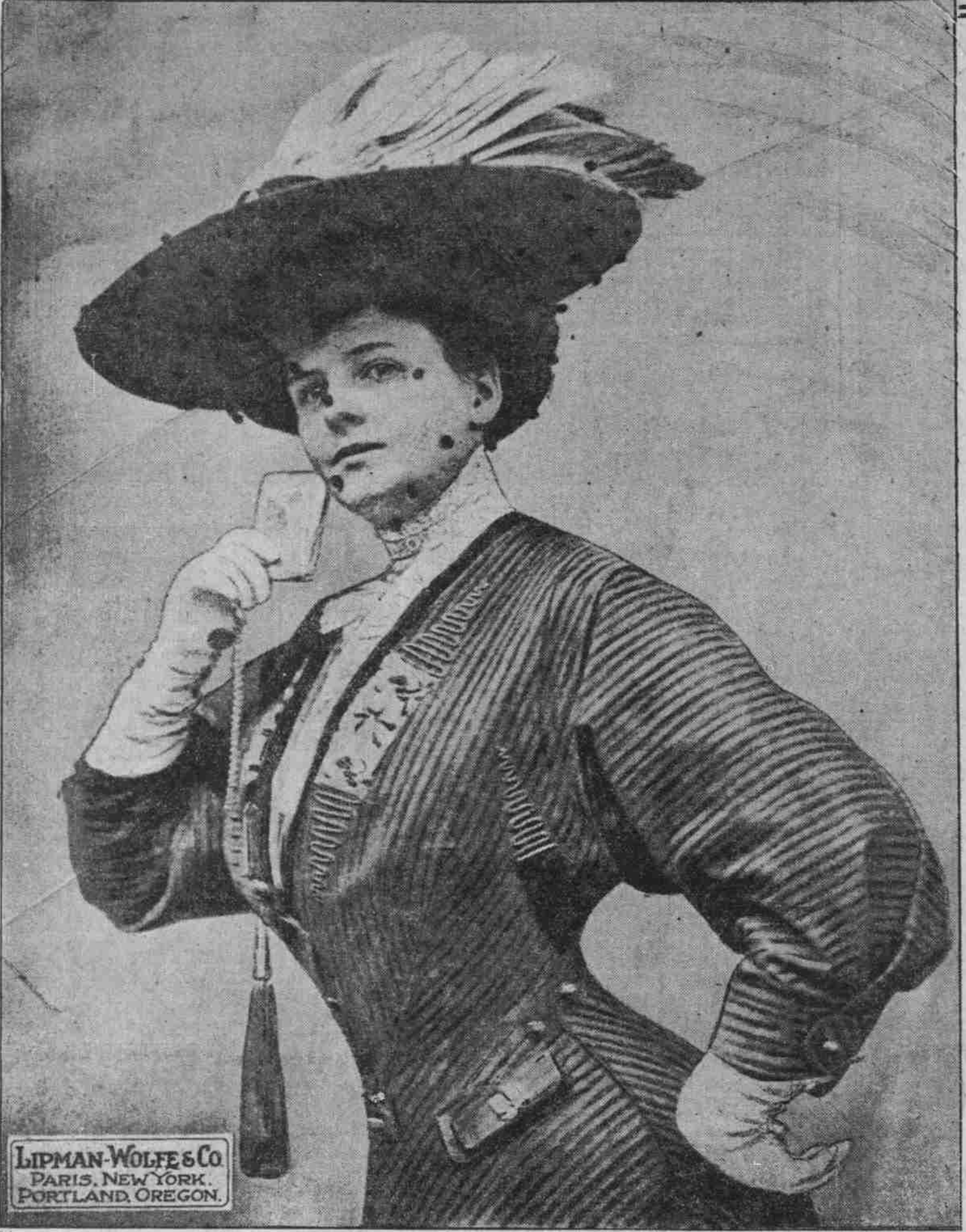
The American Girl of 1908

PORTLAND, OREGON, SUNDAY MORNING, FEBRUARY 16, 1908.