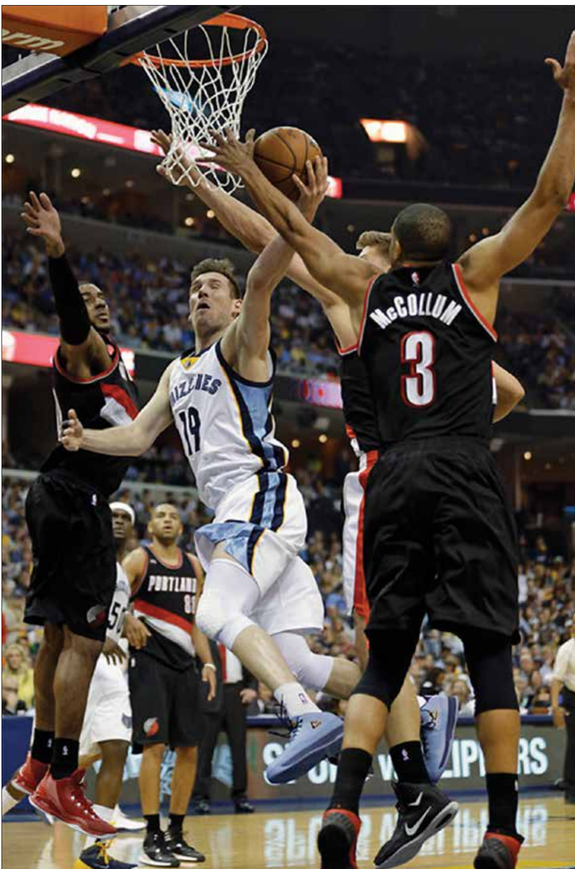
Memphis guard Beno Udrih scores two of his 20 points to lead the Grizzlies past Portland in the first game of a best-of-seven NBA playoff series. Game two is Wednesday at 5 p.m. (PDT broadcast on KGW), also in Memphis. Games three and four are Saturday and Monday at 7:30 p.m. in Portland.

Portland coach Terry Stotts called Udrih the "X-factor" in the