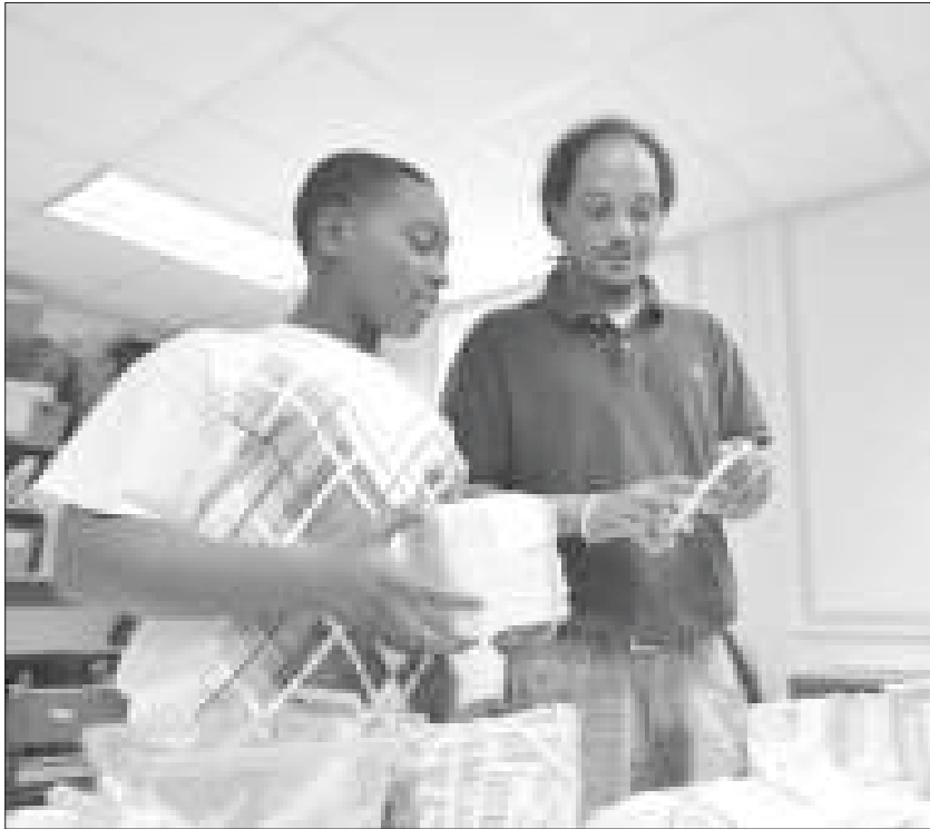
'180 Days: Hartsville,' a documentary exploring a town success to educate students challenged by race and poverty, premieres Tuesday, March 17 at 8 p.m. on PBS.

Advertise with diversity in The Portland Observer Call 503-288-0033 ads@portlandobserver.com