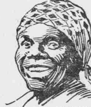
"I've in town, Honey!"

to make buckwheat cakes—if you make them the easy Aunt Jemima way! All you need is a package of Aunt Jemima Buckwheat Flour—you add nothing but water.