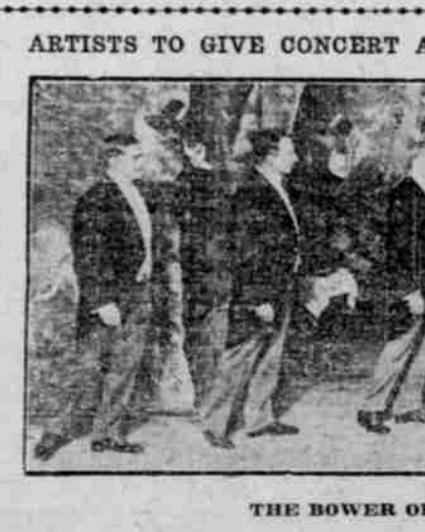
THE BOWER OF MELODY COMPANY OF THE EMPRESS THEATER.

billings system from the monthly plan to the quarterly plan proposed by City Commissioner Daly.