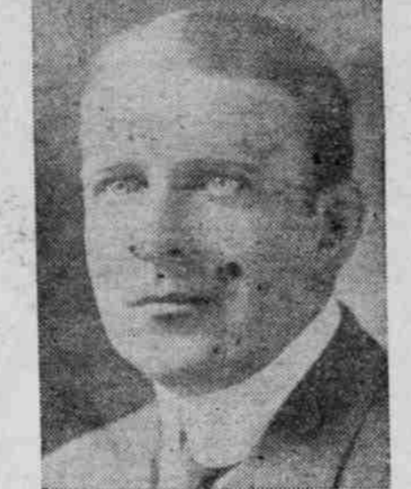
ABOVE—JOHN PUPROY MITCHEL, ELECTED MAYOR OF NEW YORK. BELOW—DAVID WALSH, ELECTED GOVERNOR OF MASSACHUSETTS. (PHOTO COPYRIGHTED BY HARRISON WILSON SULZER, ELECTED ASSEMBLYMAN SIXTH NEW YORK DISTRICT.)

JACKSONVILLE, Ill., Nov. 4.—Votes by women prevented the return of saloons to Jacksonville today by a majority of 2404. The wet and dry fight overshadowed all other issues in the election. Women cast 3635 votes, of which 2327 were against the saloons. Only 3507 men voted.