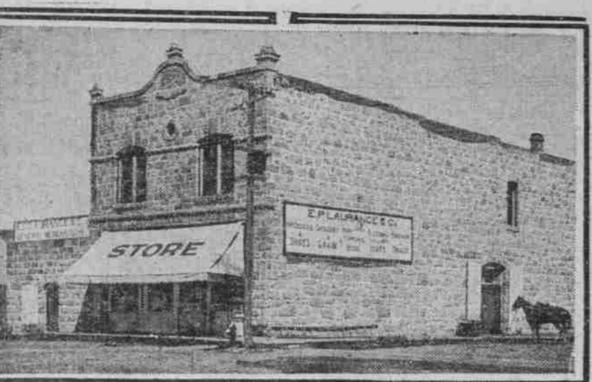
Business Block Built of Volcanic Ash Rock 15 Years Ago

Great Quarry Within Few Miles of Prairie City Furnishes Durable and Fireproof, Yet Easily Worked Building Material of Good Colors.