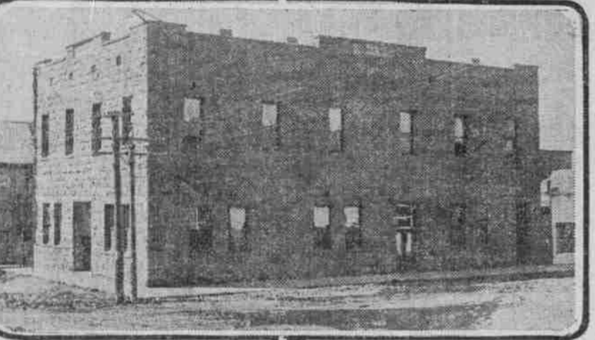
Masonic Temple Built of Volcanic Ash

THE rock quarries which for a half century or more have studied more or less critically the formation known locally as the Strawberry Range of the Blue Mountains, with its singularly beautiful valleys, laughing crystalline streams and charming scenery, are practically a unit in the opinion that it is the result of volcanic agency and that the Titanic upheaval that gave it birth is of very recent date as dates are reckoned in geologic time; so recent indeed as to have occurred within the age of man. Throughout the John Day Valley evidences of recent volcanic activity are everywhere abundant. The mantle rock at the base of the mountains is scant and narrow. In some sections it has not yet extended to the bench lands, and the hardened volcanic mud and detritus lies bare on the surface, while everywhere in the mountainous and hilly sections the exposed rocks are yet sharp and jagged, as though the mighty forces that thrust them vertically through the earth's crust had operated but yesterday.