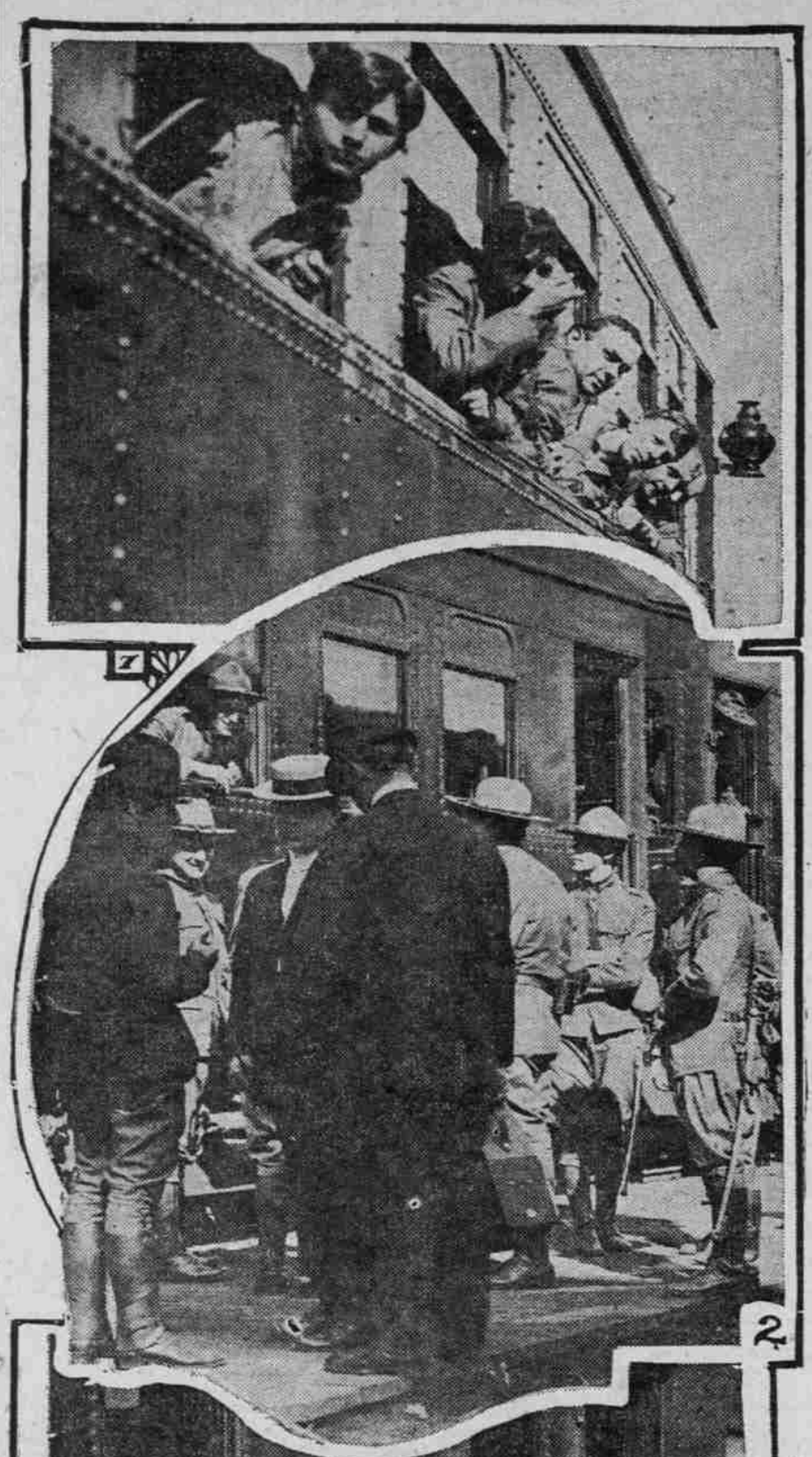
THE BOYS SHOUTING THEIR GOODBYES AS THE TRAIN PULLED OFF.—OFFICERS CHATTING WITH CITIZENS JUST BEFORE DEPARTURE.—OFFICERS TELLING NEWSPAPER MAN ABOUT THE ENCAMPMENT.