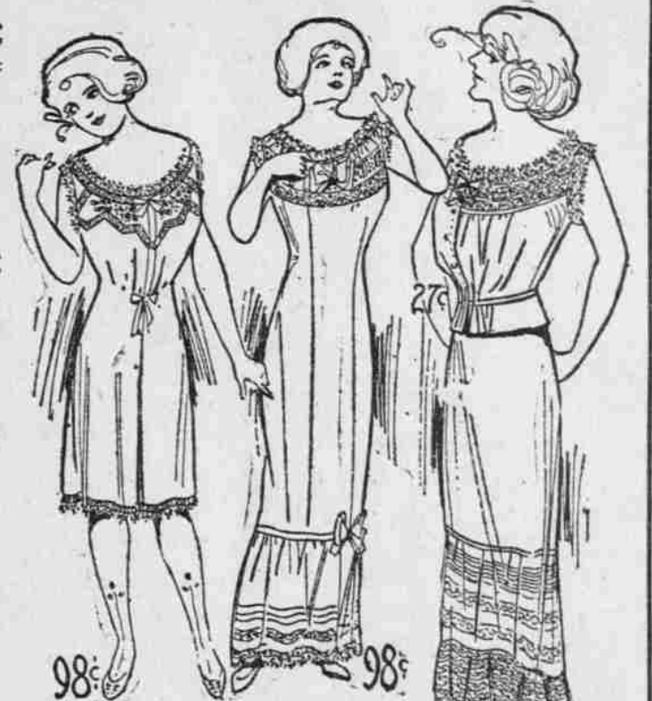
—Second Floor, New Building.—Mail Orders Filled.

Infants' $1.25 Skirts—of lawn or nainsook, on waists finished with dainty ruffles of lace or embroidery. Specially priced for this sale at, each 98c