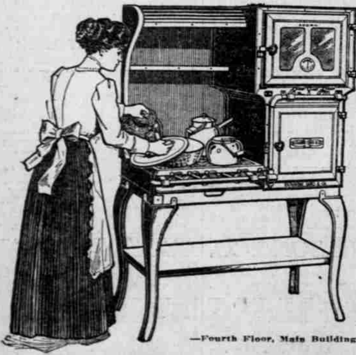
—Fourth Floor, Main Building.

"Acorn" Stoves and Ranges Are Sold Here Exclusively in Portland