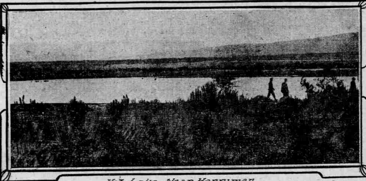
Hot Lake, Near Harriman