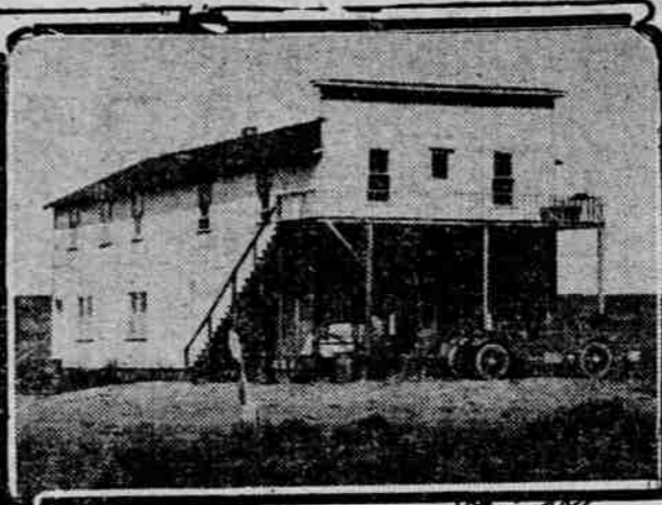
Store At Harriman