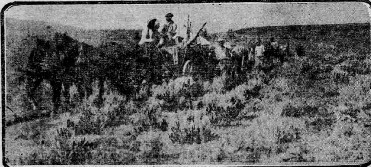
Advance Guard Of Railroad Engineers On Way To Pitch Camp At Riverside