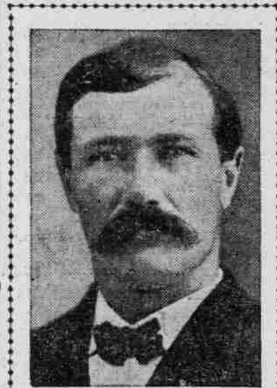
deen Shipbuilder, Killed by

well known, and are identified by fill residents of Viesca and the surrounding haciendas as having been with the ban-dits during the raid.