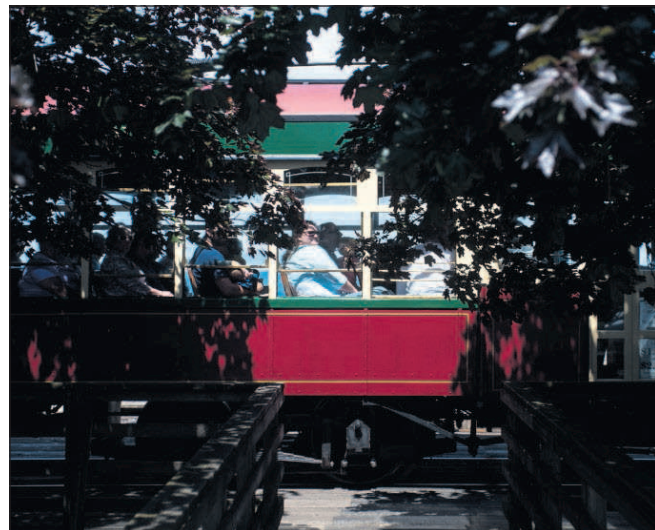
The city of Astoria is repairing the street-end bridges in downtown to accommodate cars, trucks and the Astoria Riverfront Trolley. The Port of Astoria Commission would like the tracks kept ready for freight service, as well.