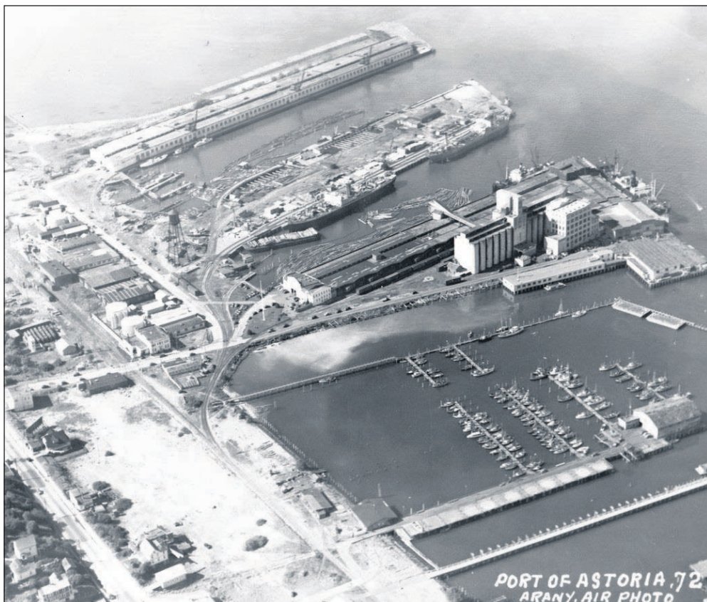
A 1972 aerial photo shows the multiple rail spurs that used to line the Port of Astoria's docks. The last regular freight service to Astoria was more than 20 years ago, but the Port of Astoria wants to the city to maintain rail access just in case freight returns.

Repairing the rail between Wauna and Tongue point has been estimated at $1 million a mile. Rece Bly, a retired attorney and entrepreneur, is the most recent party to offer his vision of Tongue Point. Bly said there would need to be about 5,000 rail cars of cargo a year to Tongue Point to justify