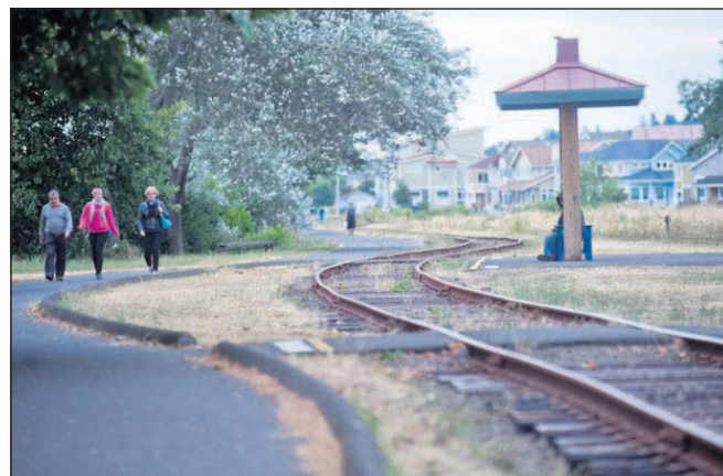
The city of Astoria acquired the right-of-way to a former Burlington Northern Santa Fe LLC rail corridor in 1996 through a railbanking agreement to preserve historic tracks.

She estimated it would take the city an additional $950,000 to bring the bridge ends up to